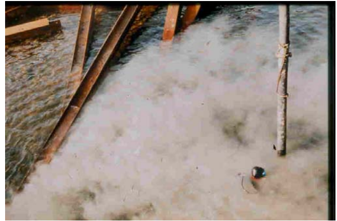
Pumping concrete with and without an underwater concrete admixture.